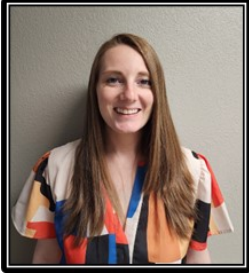
Subsidy Child Care Specialist