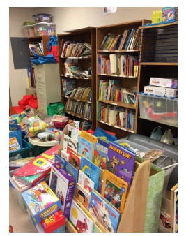
Books, Books, Books